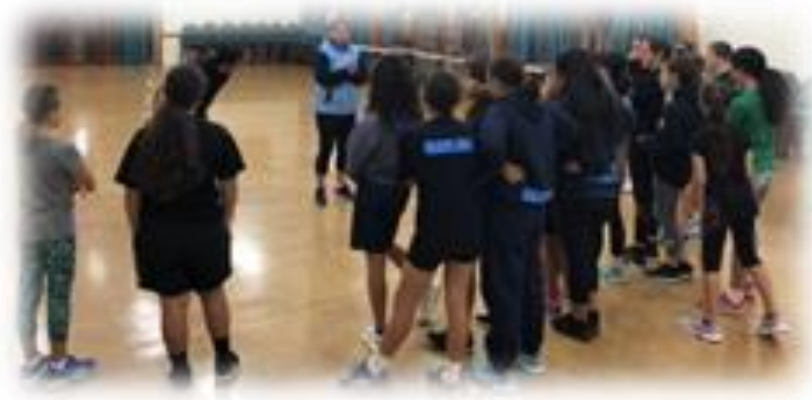
Howick Pakuranga Netball Centre

Papakura Netball Centre hosted their first session of the PDP with 21 enthusiastic Yr7 & Yr8 girls. The session was delivered by 3 local coaches and a member of the Northern Comets BEKO team.