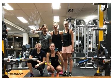
West Hub Gym