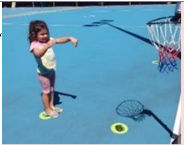
Children's Fun Day at Netball Rodney

Netball Northern Zone supported Netball Rodney in delivering netball stations for all ages and stages. Buckets for the babies, varying goals for children 3 years and up. The theme for the day was "Everyone have a go".