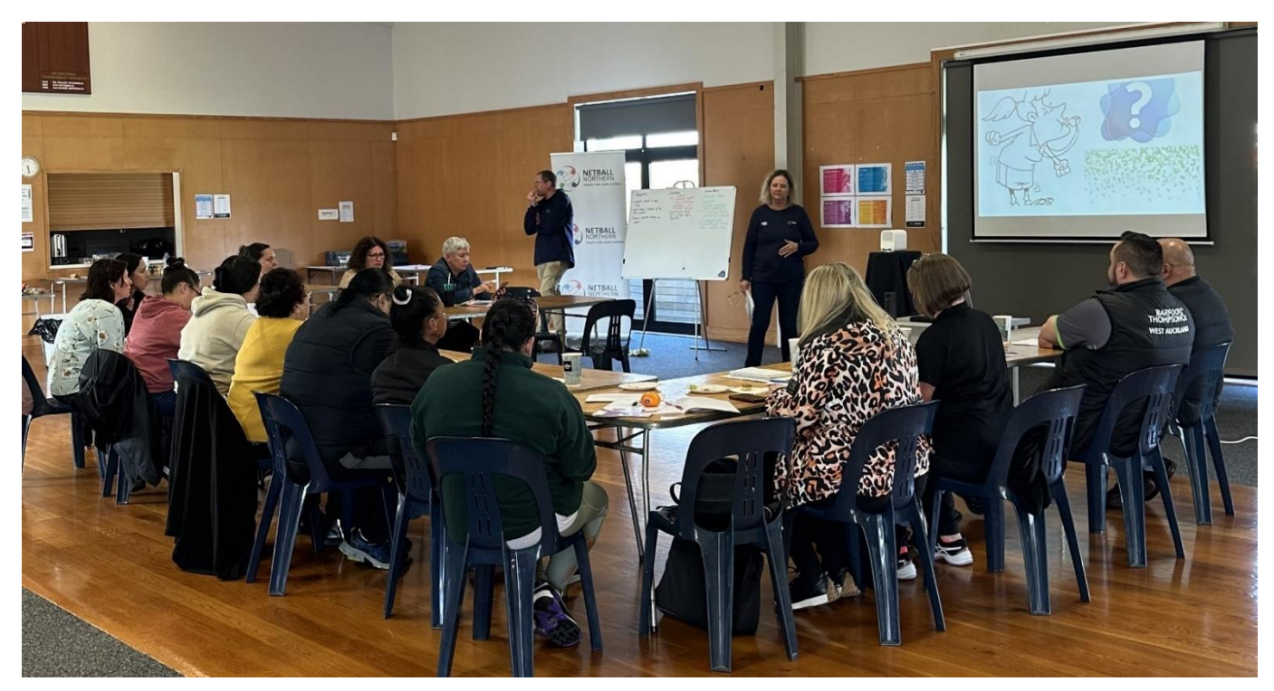
Centre Engagement 2023 group discussion on Umpire – the question of payment